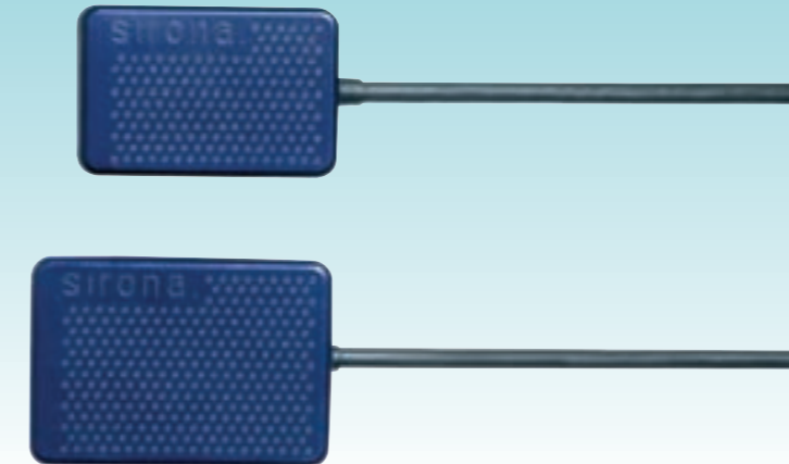
Sirona ® XIOS Intraoral Sensor System

Software of Excellence are one of the UK's largest suppliers of digital imaging solutions.