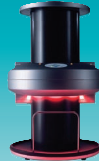
VistaScan Combi Plus