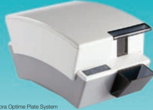
Satelec ® Digora Optime Plate System